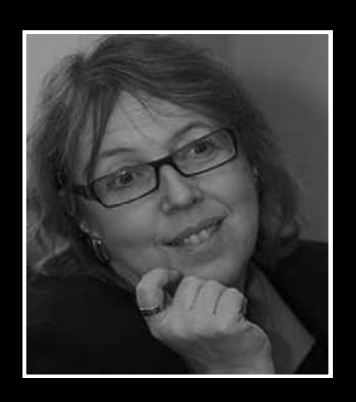
MAY, Elizabeth Green Party of Canada Sierra Club of Canada Prevent Cancer Now SHIELD for Canadian Cancer Society