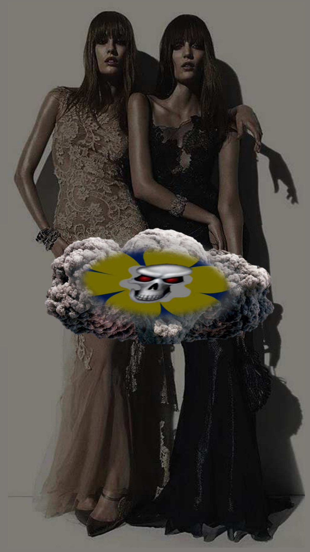
FORCE OF NATURE | THE WHOLE TRUTH FROM AN INDEPENDENT PERSPECTIVE from National Organization Responding Against HUJE that seek to harm the Green Space Industry (NORAHG)